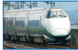
Yamagata Shinkansen "TSUBASA"

Yamagata Shinkansen (421.4 km) Train Name: TSUBASA