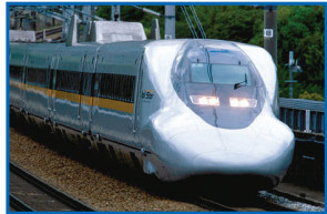
Sanyo Shinkansen "HIKARI Rail Star"

Tokaido Shinkansen (552.6 km) Train Names: NOZOMI, HIKARI, KODAMA (Tokyo thru Hakata, 1,174.9km)