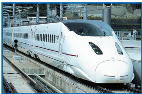
Kyushu Shinkansen "TSUBAME"

Note: There are three types of train services, "NOZOMI," "HIKARI" and "KODAMA" on the Tokaido and Sanyo Shinkansen, and the stations at which trains stop vary by train types. The JAPAN RAIL PASS is only valid for "HIKARI" and "KODAMA" trains, and not valid for any seats, reserved or non-reserved, on "NOZOMI" trains. To travel on the Tokaido and Sanyo Shinkansen, the pass holders must take "HIKARI" or "KODAMA" trains, or pay the basic fare and the Shinkansen express charge to take "NOZOMI" trains. (See p. 5 for detail)