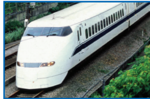
Tokaido & Sanyo Shinkansen "HIKARI"

Tokaido Shinkansen (552.6 km) Train Names: NOZOMI, HIKARI, KODAMA (Tokyo thru Hakata, 1,174.9km)