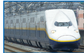
Tohoku & Joetsu Shinkansen "Max"

Tohoku Shinkansen (631.9 km) Train Names: HAYATE, YAMABIKO, NASUNO, Max-YAMABIKO, Max-NASUNO