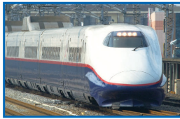
Nagano Shinkansen "ASAMA"

Akita Shinkansen (662.6 km) Train Name: KOMACHI