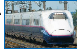
Tohoku Shinkansen "HAYATE"

Nagano Shinkansen (222.4 km) Train Name: ASAMA