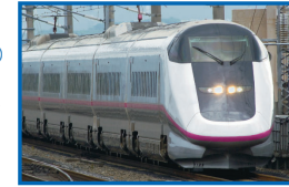
Akita Shinkansen "KOMACHI"

Yamagata Shinkansen (421.4 km) Train Name: TSUBASA